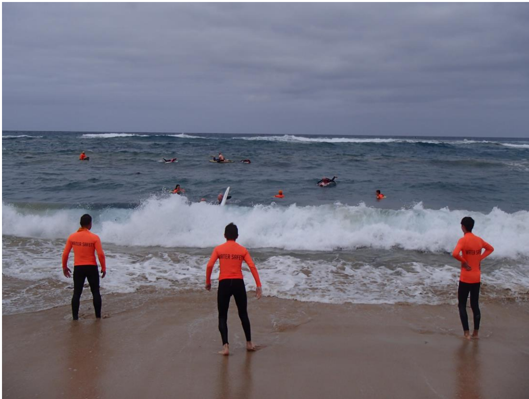
Water Safety were all over the nippers during the rough conditions, many thanks to them